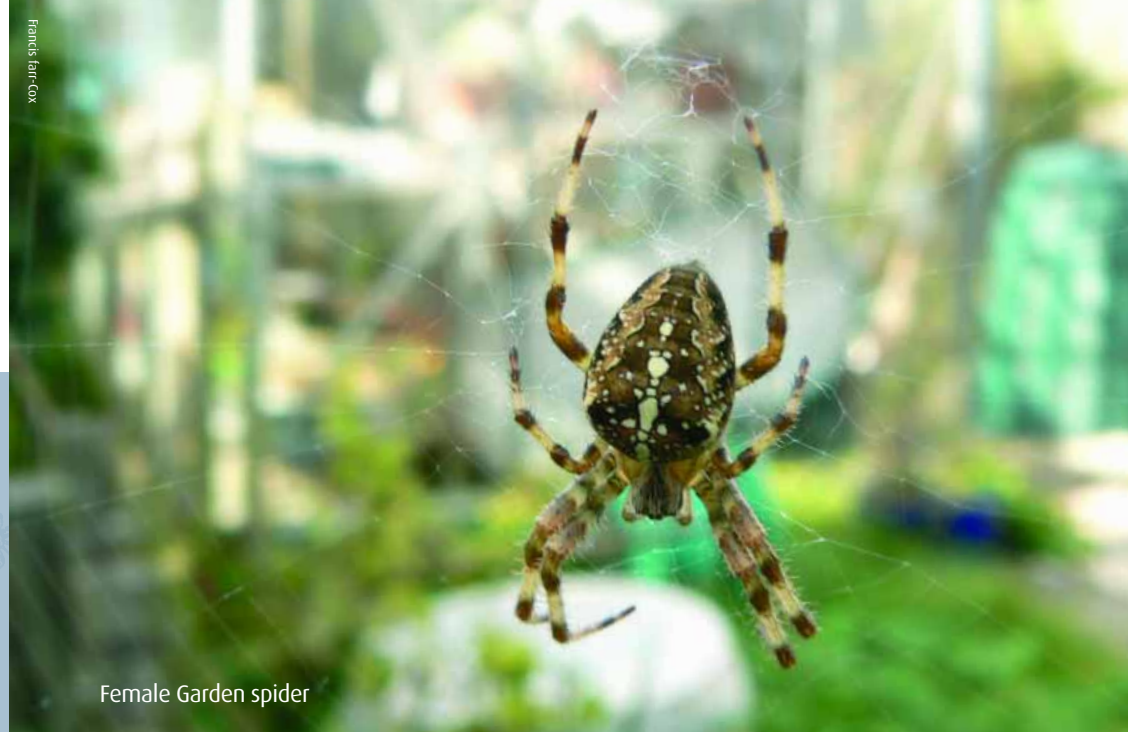
Female Garden spider

The Garden spider is probably our most familiar, common spider found outdoors. They are most noticeable in autumn when full grown adult females are obvious in the centre of their bicycle-wheel-shaped orb webs. The webs are iconic structures, and are what most people think of as a typical spider's web.