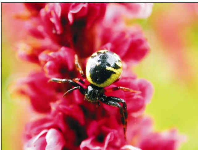
Figure 2. Synema globosum

A thorough search of the Vertigro site on 27 July 2011 revealed no more specimens of Neoscona but, to my amazement, a mature female Synema globosum (Fabricius, 1775) (Thomisidae) (see Figure 2) was spotted on a Polygonum flower. Synema globosum is on the SRS list but with only three records in south-east England (SRS website, 2011). It is common across Europe, as is Neoscona adianta (Helsdingen, 2011). The garden centre regularly brings in plants from Italy, France, Spain and Holland, countries where both species occur, so the Synema is most likely to have been a recent import. The question remains, was the Neoscona specimen home grown or another import?