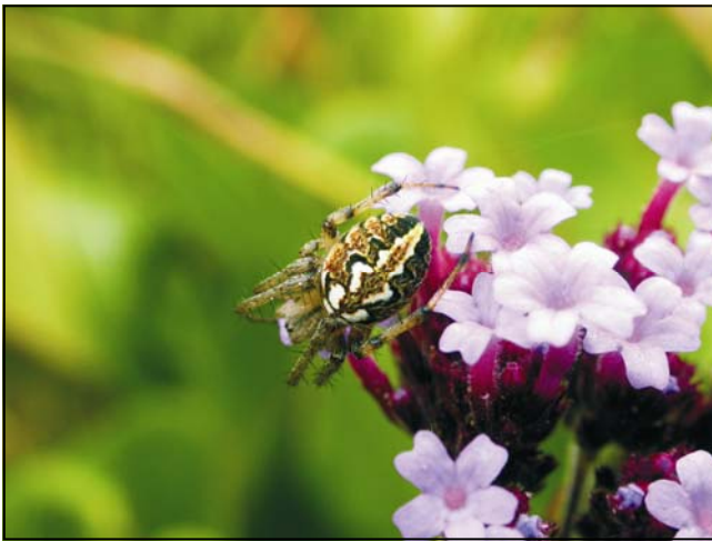
Figure 1. Neoscona adianta

from Strensall Common (minimum 2 km) to the garden centre, this individual could have originated locally. On the other hand, this was a garden centre and one has to be wary of records from such places given the import of