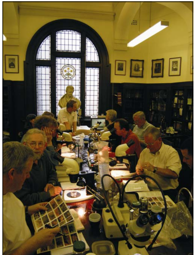
Figure 2. Harvestman workshop, Perth 2010

© 2011 THE BRITISH ARACHNOLOGICAL SOCIETY. Photocopying of these publications for educational purposes is permitted, provided that the copies are not made or distributed for commercial gain, and that the title of the publication and its date appear. To copy otherwise, or to republish, needs specific permission from the Editor. Printed by Henry Ling Ltd, DORCHESTER, DT1 1HD. ISSN 0959-2261.