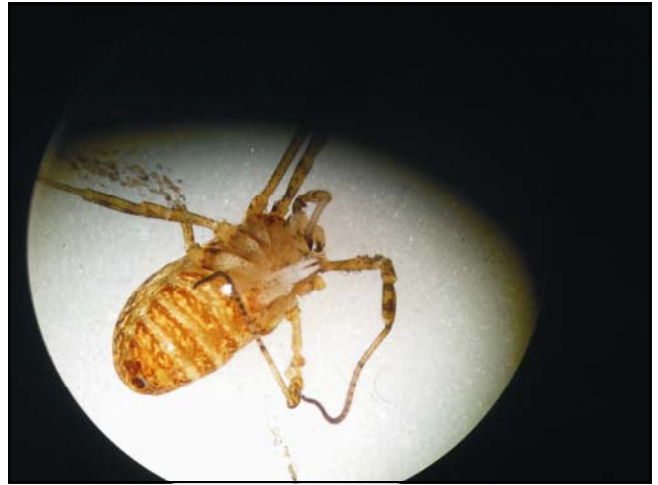
Figure 1. Harvestman under microscope at Kindrogan weekend identification course 2011

Overall the course was an excellent launch pad for my interest in harvestman recording and thanks to Mike's expert guidance and infectious enthusiasm I have come away feeling confident about my approach to collecting and identification. With only 27 UK species (currently) this is a group where there is an opportunity to quickly become competent enough to produce reliable records but still with enough rarities and new arrivals to keep more experienced recorders on their toes! I look forward to contributing my records and filling in some of the gaps in the north-east section of the map!