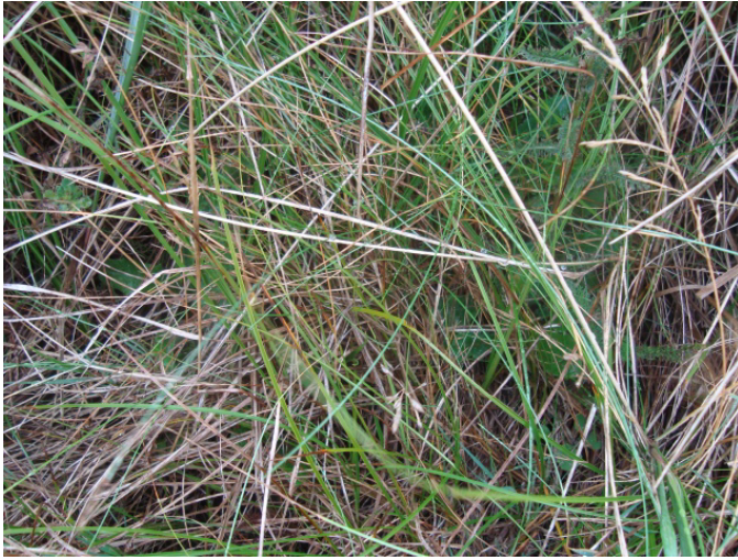
Figure 2: Typical marram grassland on Ynyslas Dunes.