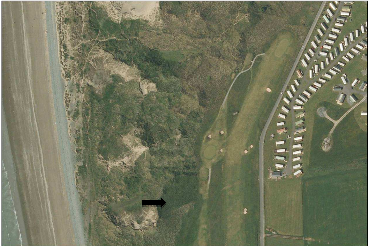
Figure 5: Close-up of location of the October 2014 record of Agroeca dentigera . © Crown Copyright and database right 2013. Ordnance Survey.