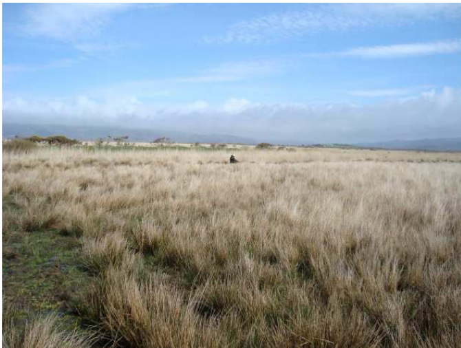
Figure 3: Sieving litter at Morfa Borth on Cors Fochno, April 2014.

A total of 94 other spider species was also found during the 2013 and 2014 surveys (see Table 2 and Appendix 1). Eleven of these are thought to be recorded from Dyfi NNR for the first time, including seven from Ynyslas Dunes and four from Morfa Borth, Cors Fochno. Two Nationally Rare and two Nationally Scarce spiders were found. Species associated with sand dunes included: Ceratinopsis romana ; Mecopisthes peusi , a single female of which was collected on 3 rd October 2013 from the northern end of the dune system (Appendix 1); and Philodromus fallax , a single female was collected in the late afternoon on 9 th April 2014, at the top of a yellow dune ridge to the west side of the site near the elevated boardwalk (Appendix 1).