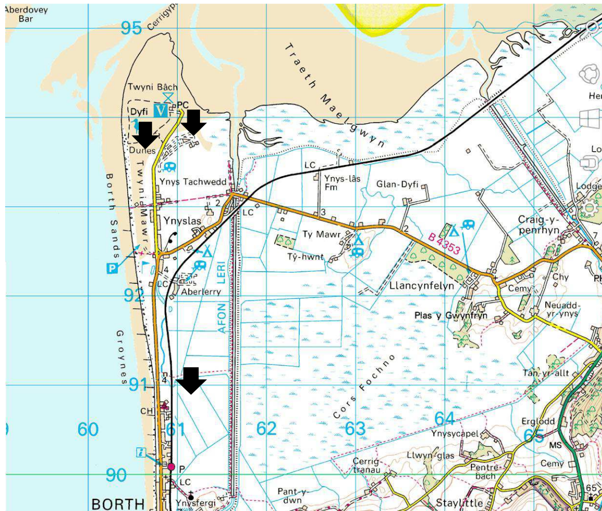
Figure 1: The main sampling sites in 2013 and 2014.

Grubbing at the base of dune vegetation and sieving litter were the main survey methods. A modified leaf blower was used on one occasion, but static traps (pitfalls) were not deployed. Much of the survey time was dedicated to searching dunes in the area where the spider had been previously recorded. Two person days were also used in attempts to cover the remaining dune system and to investigate part of Cors Fochno as another potential Agroeca dentigera site.