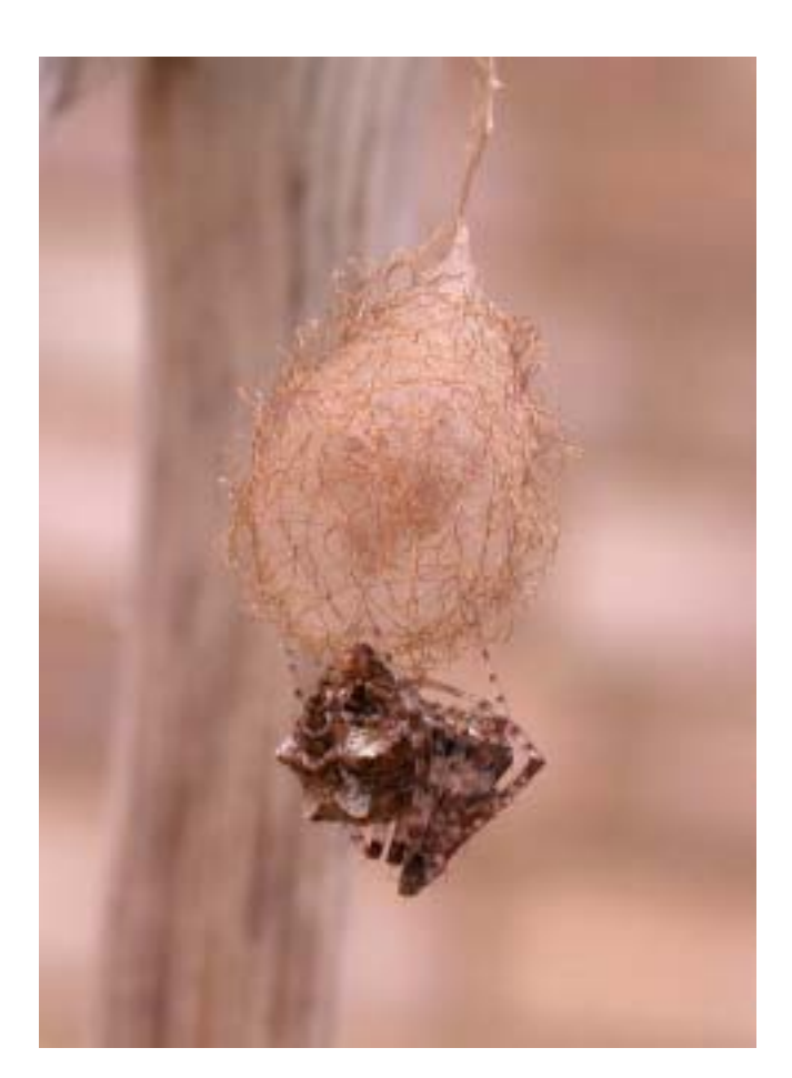
Figure 1. Ero aphana (Walckenaer, 1802), female witth egg cocoon.

During a second visit to the South Essex site on 6th June, a second female Ero aphana was found, this time beaten from the lower branches of a gorse bush at the western edge of the site. This region of south Essex is geologically complex with a chalk outcrop north of the Thames variously overlain with sands, and so the vegetation frequently has areas containing plants normally associated with chalk grassland adjacent to or mixed with areas containing acid grassland plants. The area has been quarried over a long period of time, since at least the sixteenth century, but in modern times mineral extraction became much more extensive and the area between Purfleet and Grays contained a remarkable complex of old quarries. Unfortunately, local councillors and planners have long viewed these quarries as an eyesore and blight on the region, and most sites have already been lost to industrial and retail use, and to massive housing developments such as