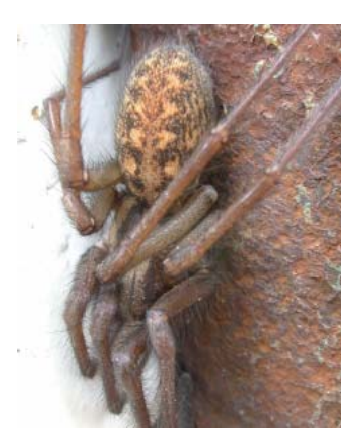
Figure 2. 'Worth checking every Teg.'

borders with shrubs and herbaceous plants, but with no trees, and flanked by similar gardens. Most of the front is a tarmac drive, though the surviving pitfall was in the border adjacent to the drive. The house is a small semi-detached bungalow about 30 years old, with a two-storey extension and integral garage, on the edge of a large modern housing estate. However, the back overlooks a disused gravel pit, now a nature reserve, fringed with willows and Phragmites , from which it is separated by a fence and path. The River Ouse is about 400 m away.