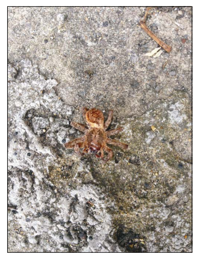
Figure 1. Zoropsis spinimana on London pavement.

On 21st September 2012 Heather Ticheli found a large spider in her clothes and left the beast to die on a pavement in Islington, London (Fig. 1). She wondered whether an unidentified bite she had received the previous week was from a similar spider that may be living in her house, and she sent the picture to Pip Collyer in an effort to find out what spider was involved. Pip forwarded this to me for my opinion and all we could suggest from the picture was that it looked rather like a lycosid, and a specimen was needed.