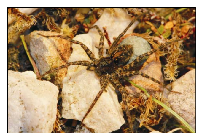
Figure 1. Pardosa trailli ; female with egg sac.

There are currently only 30 records in 17 hectads submitted to the SRS database for Pardosa trailli . There are only three locations with records since 1992 and the last of these was in 2003.