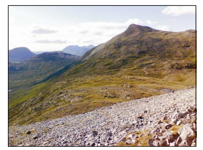
Figure 2 . Sgurr Ruadh from Fuar Tholl; Pardosa trailli habitat in the foreground.

The site on Fuar Tholl is about 10km from the nearest previous record on Beinn Eighe. I am unable to provide an answer as to what is characteristic of the scree area other than it being dominated by quartzite. I would be interested in visiting some of the other sites where the species has previously been found to see if that sheds any further light on its requirements.