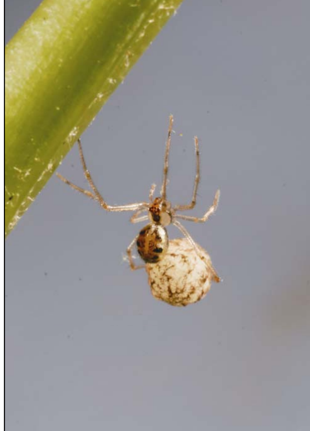
Figures 1 & 2. Rugathodes sexpunctatus at Glasgow Necropolis. Photographs © Mike Davidson

Spiders and Harvestmen recorded on 4<sup>th</sup> & 31<sup>st</sup> July 2012 at the Glasgow Necropolis NS604655