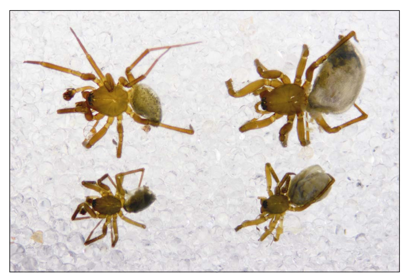
Figure 6. Centromerita size comparison from pitfall material. C. bicolor top row, C. concinna below (males left, females right).

Male and female specimens of Centromerita bicolor are consistently larger than those of C. concinna . This is obvious in mixed samples (Fig. 6), but difficult to appreciate when only one species is present in a sample. Measuring the length of metatarsus IV will aid separation (Tables 1–2): between 1.05–1.37 mm for C. bicolor and between 0.69–1.00 mm for C. concinna .