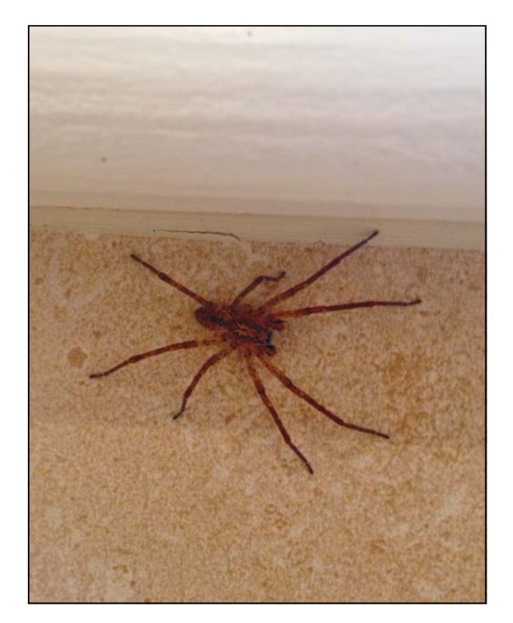
Figure 3 . Male Zoropsis spinimana taken in February 2012.

might already be well established in parts of London, and is certainly established in Heather Ticheli's home with at least an adult female, adult male, juvenile and other adults or subadults. I will clearly have to eat my words, and it looks as though it is another species to be added to the British checklist.