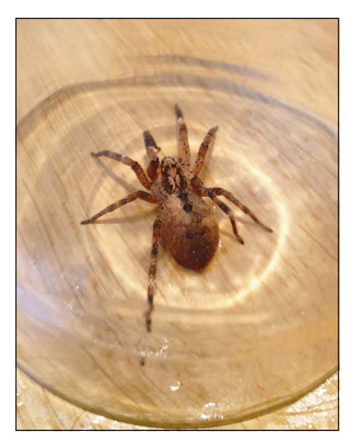
Figure 2. Zoropsis spinimana taken in February 2012.

Heather says the first Zoropsis she can document appeared in her home in February 2012 (Fig. 2)) and she did see a few more from February to September but did not photograph them. However, in October in the past few weeks she has seen the one trapped in her clothing, another near the ceiling (a photo provided) and another in the bathroom (an adult male, Fig. 3). These photos include what is clearly an adult male and a juvenile, as well as other probable females.