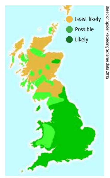
Daddy-longlegs spiders in Britain

Unlike many spider species, Daddy-longlegs spiders are so easily recognized from photographs that everyone can help to map their distribution by sending in records – just visit the Spider Recording Scheme website at: britishspiders.org.uk/srs surveys