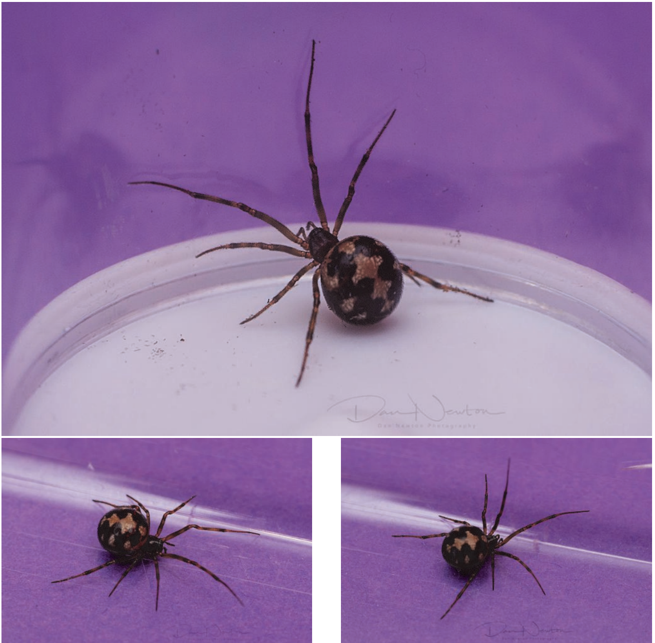
Figures 2-4. Steatoda triangularis female in Lincolnshire.

at that. Only because I have a vested interest, and the books and inclination to back it up did I realise what it could be. And depressingly, I am ashamed to admit that if I had seen it 5 years ago, then there is a chance I would have just squashed it. I know the people here at SRS would be understandably upset with that but it is how a lot of the general public views spiders. It is a shame because I have slowly come to realise just how fascinating they can be.