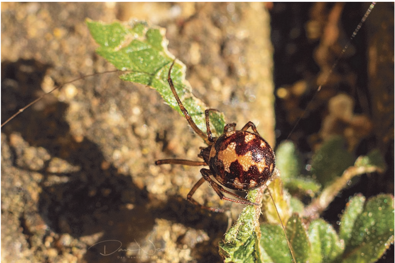
Figure 1. Steatoda triangularis female in Lincolnshire.

It is probably also worth considering that my "5th Sighting" of the species is probably not accurate. It is very likely that S. triangularis is much more widespread than we think but it takes a certain 'type' of person to recognise it, photograph it and record it. If I hadn't been at home, my partner would have probably ignored it. If I hadn't been recording a Garden List, I would have probably dismissed it as a type of false widow and left it